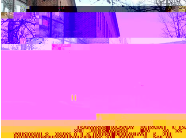
ADA Challenges - Tisch LC