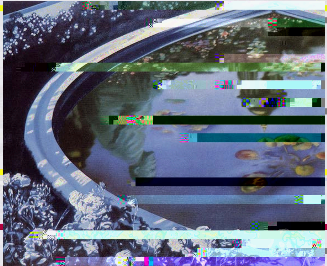
Lucio FANTI Les Nympeas 1974