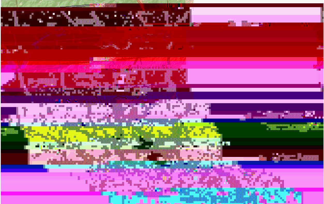
Figure 4: Saratoga County with location of Luther Forest Technology Campus marked. The campus borders rural towns but is off Route 9. Further ancillary development would most likely occur off of Route 9.