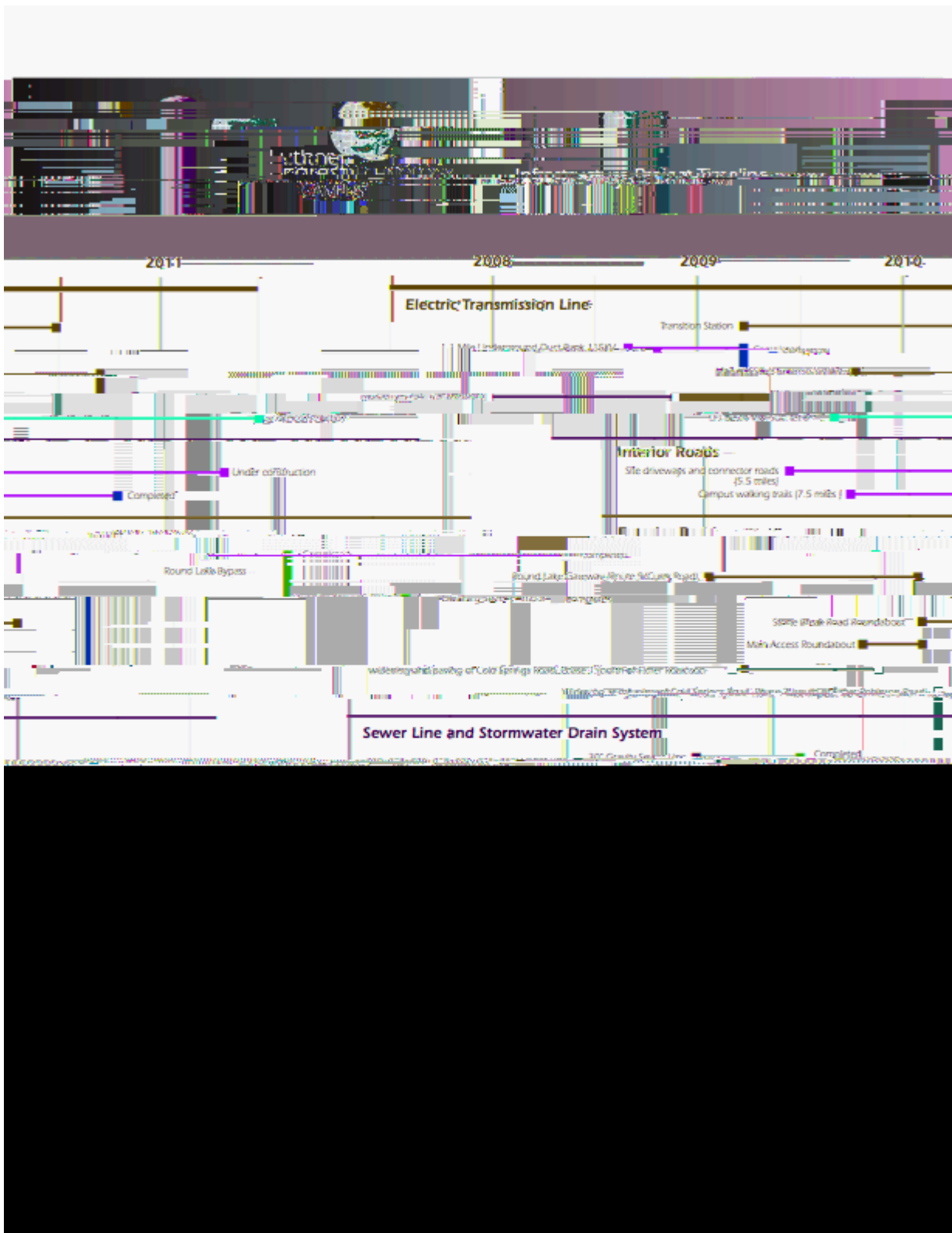
Figure 5: PDD Infrastructure Project Timeline showing all the necessary infrastructure changes needed to build Luther Forest Technology Campus