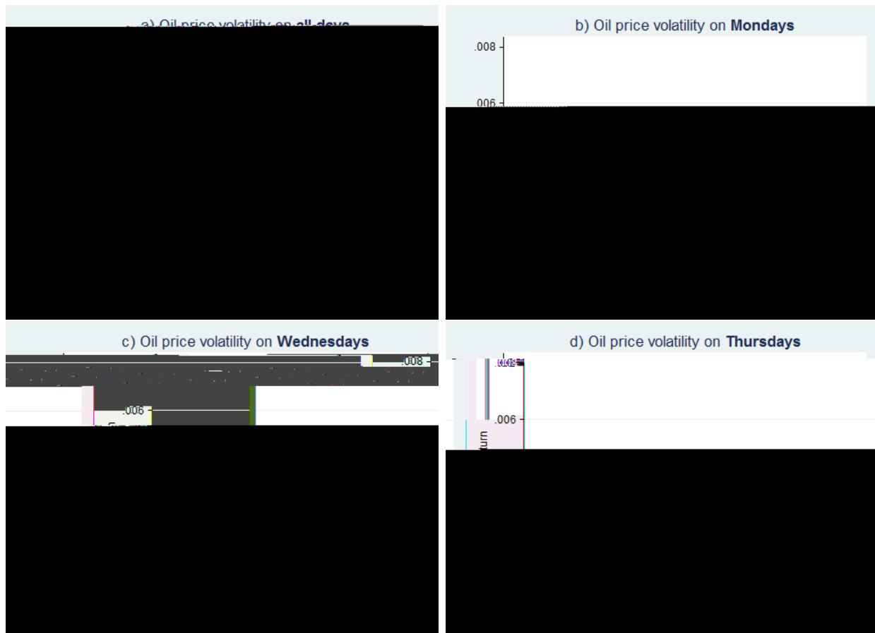
Figure 1: Intraday pattern of oil price volatility

Notes: This figure shows the intraday pattern of the NYMEX crude oil nearby contract futures price volatility. The volatility is defined as the absolute return. The first interval is not displayed to avoid skewing the graphs by the overnight gap as the first interval is affected by not only the first ten minutes of the trading day but also the period since the market closed on the previous day.